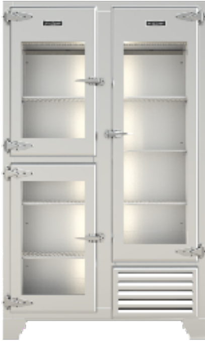
HRU2 - Glass Doors