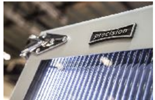
Reeded Glass Option

Give us a RAL number and we'll paint your retro refrigerator to match any colour you can dream of.